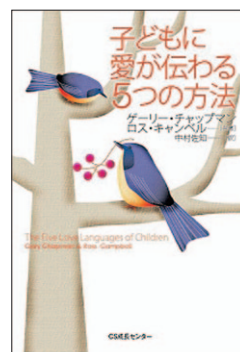
Book Review: The Five Love Languages of Children

Good for showing along with its twin production "Unlocking the Mystery of Life".