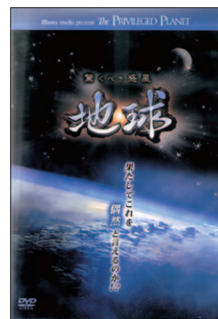
DVD Released in Japanese "The Privileged Planet"

"The nurse told me that most AIDS patients don't have any visitors. However, in contrast, people from the church came to visit me every day. By the grace of God I never felt lonely even after they left to go home. The Lord taught me the privilege of prayer, too and I prayed for all who came to visit me at the hospital "sending them back out" with a blessing on their life and witness..."